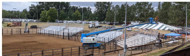
Large Aluminum Bleachers (4 sets shown)