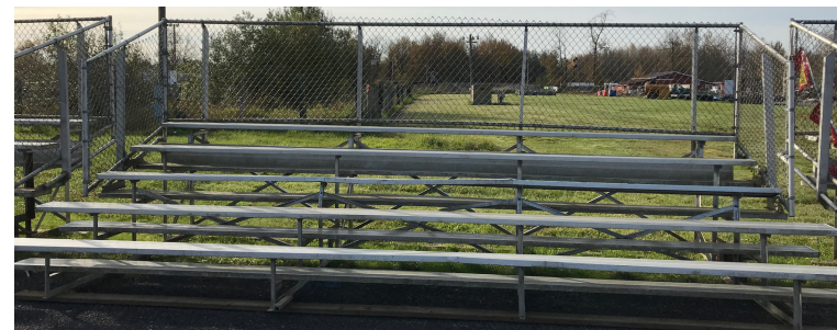
Small Aluminum Bleachers